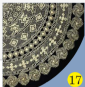
17 Lace early 20 th c. Van