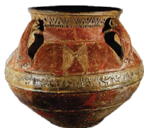
Storage vessel karas decorated with an ornamental band 11 th - 12 th cc Dvin, clay