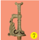
7 Winged cross 7 th c. Dvin, tufa