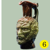
6 Vessel with the image of Caracalla 3 rd c. Mtsbin, glass