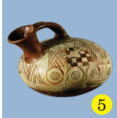
5 Askos 8 th - 7 th cc. BC Karmir Blour, clay