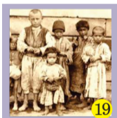
19 Photo. Orphans from Van 1915