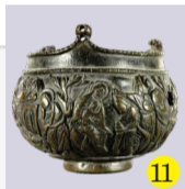
11 Censer 10 th - 11 th cc. Ani, bronze