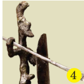
4 Statuette of a warrior 9 th c. BC Paravakar, bronze