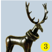
3 Statuette of a deer 12 th - 11 th cc. BC Tolors, bronze