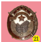
21 Order of the "Red Banner of the Armenian SSR" 1921