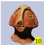
10 Handle of a lid 10 th - 12 th cc. Dvin, clay