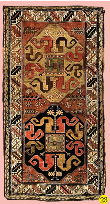
Dragon carpet 1880s Artsakh