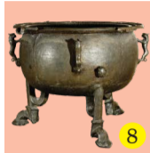
8 Baptismal cauldron 1232 Haghartsin, bronze