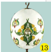
13 Egg-shaped pendant 18 th c. Cutina